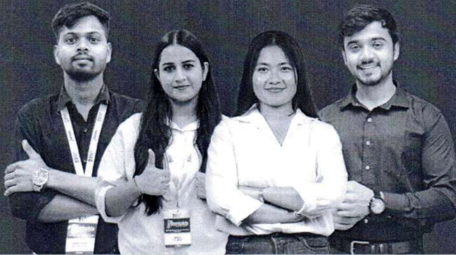
PMIS interns from top companies